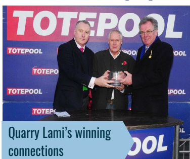
Quarry Lami's winning connections

Bronzallure and Leskinfere both ran very promising races making their debuts under rules. They were both green and will come on greatly for the experience. They both will have exciting futures and am very much looking forward to seeing them progress through the season and they will both improve greatly with another summer on their backs.