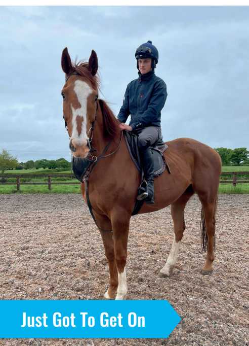
Just Got To Get On

Lady Tara Moss has settled in very well at her new eventing home.