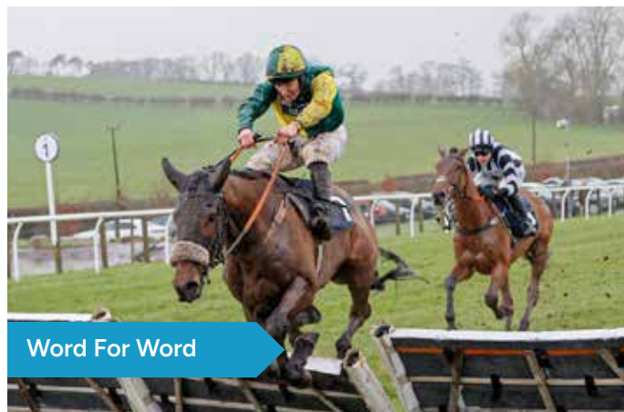
Word For Word

Aboutdamntime continues to progress and has always shaped like a staying chaser. He runs well fresh and won at Ludlow last time, despite a dramatic race. After losing position, he rallied strongly to lead before the straight, then hung right at the last, nearly allowing the runner-up past. He held on to win the feature race and avoided a steep handicap rise by not winning by too far.