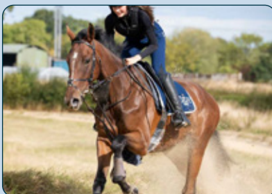
Club Horse - Masterfield