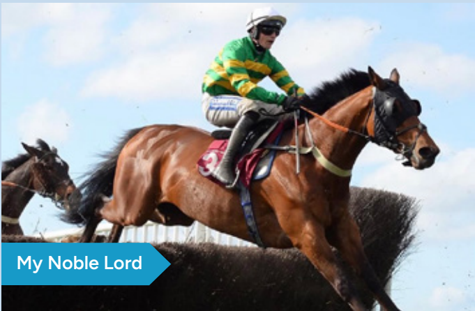
My Noble Lord